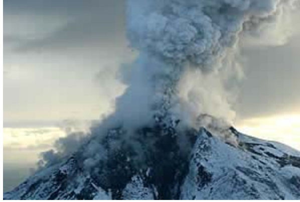
Wallace, courtesy of AVO, on January 12, 2006