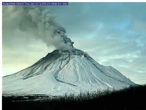
Augustine volcano, January 12, 12:05pm. Photo

"Concern Level" lowered from Red to Orange Thursday