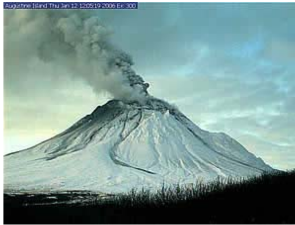
Augustine volcano, January 12, 12:05pm.