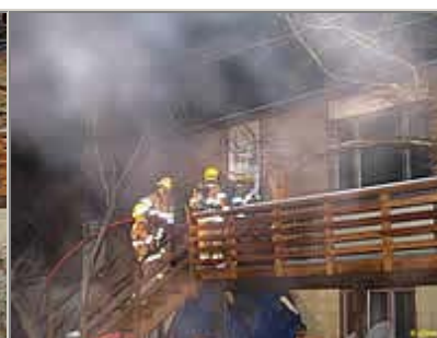
When they open the door, things can get very dangerous.