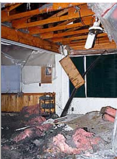
Damage from fire and water is extensive.

Large print version of this page - click here . Please note that we do not have large print versions of the other pages on this site.