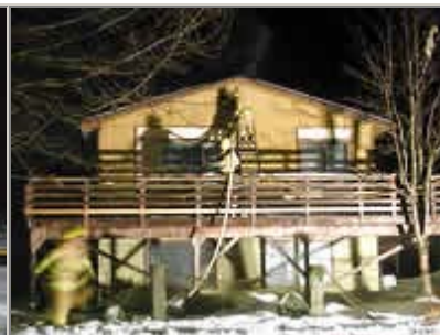
Attic fires are particularly difficult since access is minimal.