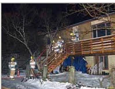
Slippery wood stairs . . .