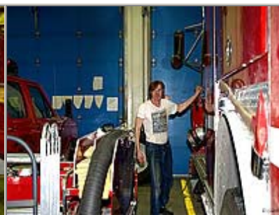
And when the fire is out, the firemen still have equipment to cleanup and put away for the next call-out.