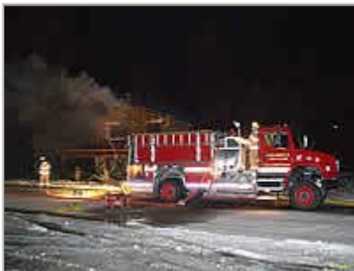
The engineer runs the pumps on the fire truck to keep the water flowing..