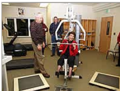
Tours of the facility included a look at the workout center.