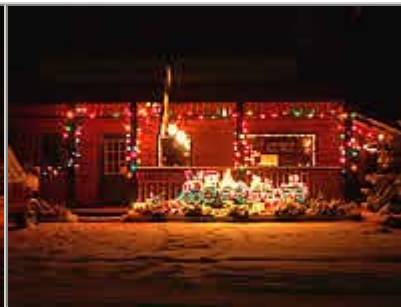
First Prize Business - $150 Herring Bay Mercantile