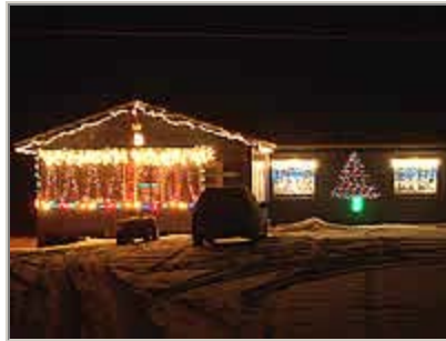
Honorable Mention - Residential Gladys Yuth