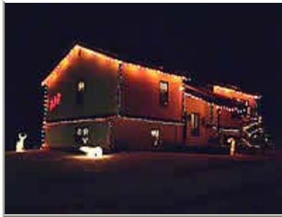
Honorable Mention - Business Bear Paw B&B

Large print version of this page - click here. Please note that we do not have large print versions of the other pages on this site.