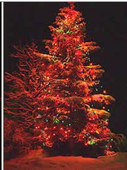
Community Christmas Tree Seldovia Chamber of Commerce