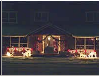
Honorable Mention - Business Yesterday's