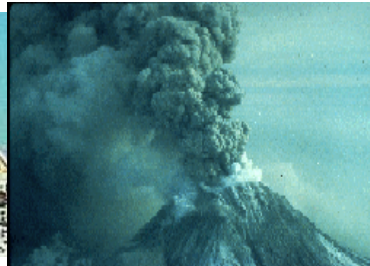
St. Augustine, 3/27/86 Photograph by M.E. Yount of the U.S. Geological Survey. Photo courtesy of NOAA'S National Geophysical Data Center. website

Just in case you are interested in details concerning current data on volcanoes around the world, click here for a very informative website .