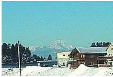
Mt. Iliamna looms high in the sky across Kachemak Bay. On a clear day is seen from Seldovia. 12/03/05