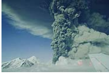
Mt. Spur, 8/18/92