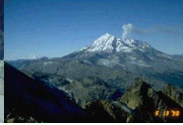
Redoubt Volcano after the 1989 to 1990 eruptions. Photograph by C. Neal, U.S. Geological Survey, 8/13/90. USGS Digital Data Series 96-040, Neal and McGimsey. website