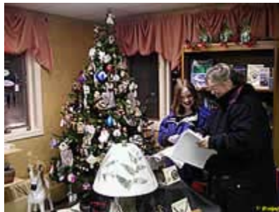
Caroling & shopping the holidays