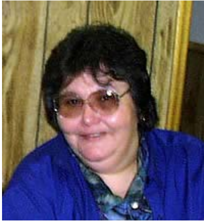
1999