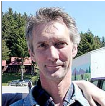
City Facilities Maintenance