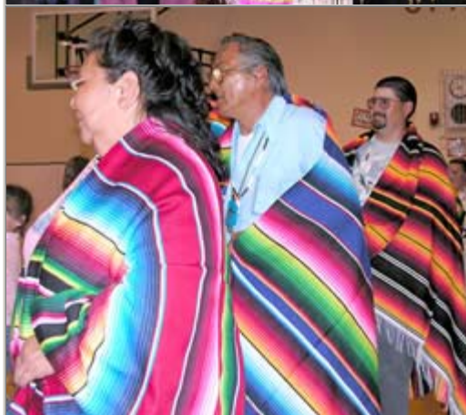
Click image for large view